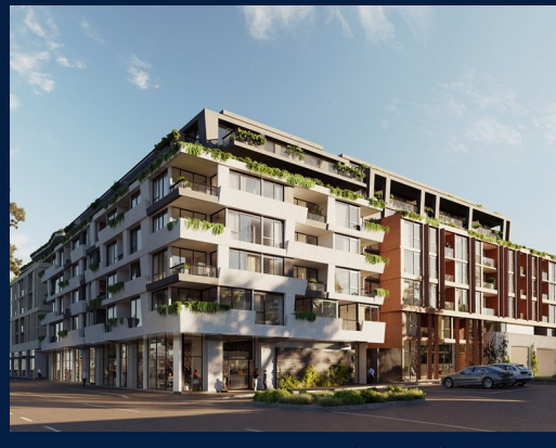
Spencer: 2 - Bedroom