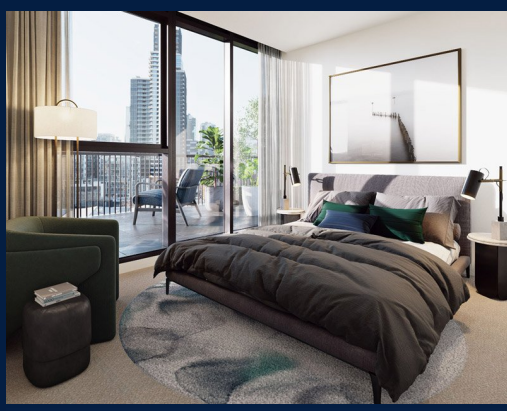
Roden: 3 - Bedroom