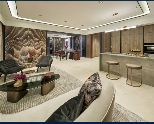
5 - Bedroom Premium