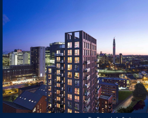
The Regent: 1 - Bedroom