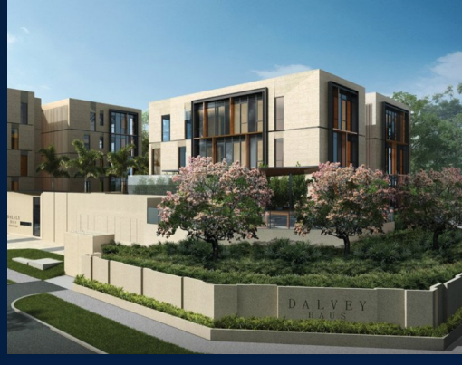
4 - Bedroom